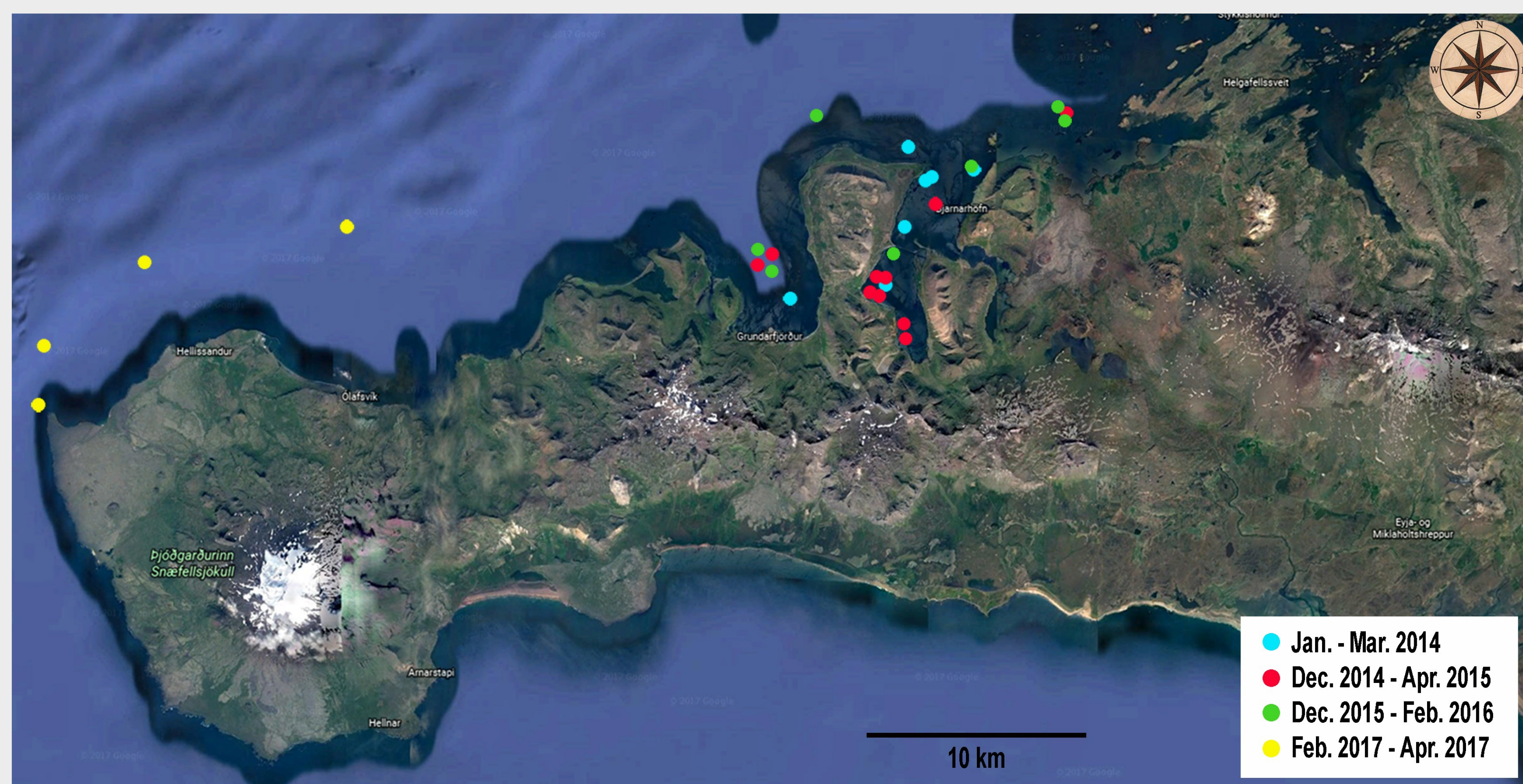
Fig. 2. Excerpt of sightings data of core group SN053 from January 2014 to April 2017. A core group is defined as stable association of individuals sighted over 30 times between 2014 and 2017. Core group SN053 is one of the most regularly sighted groups along the north side of the Snæfellsnes Peninsula, and currently consists of 9 individuals (SN053-SN060, and SN198). Encounters with this group largely coincided with the occurrence of herring in the area.

Our special thanks go to Láki Tours Whale Watching for the past and ongoing support. Visit www.orcaguardians.org for more information.