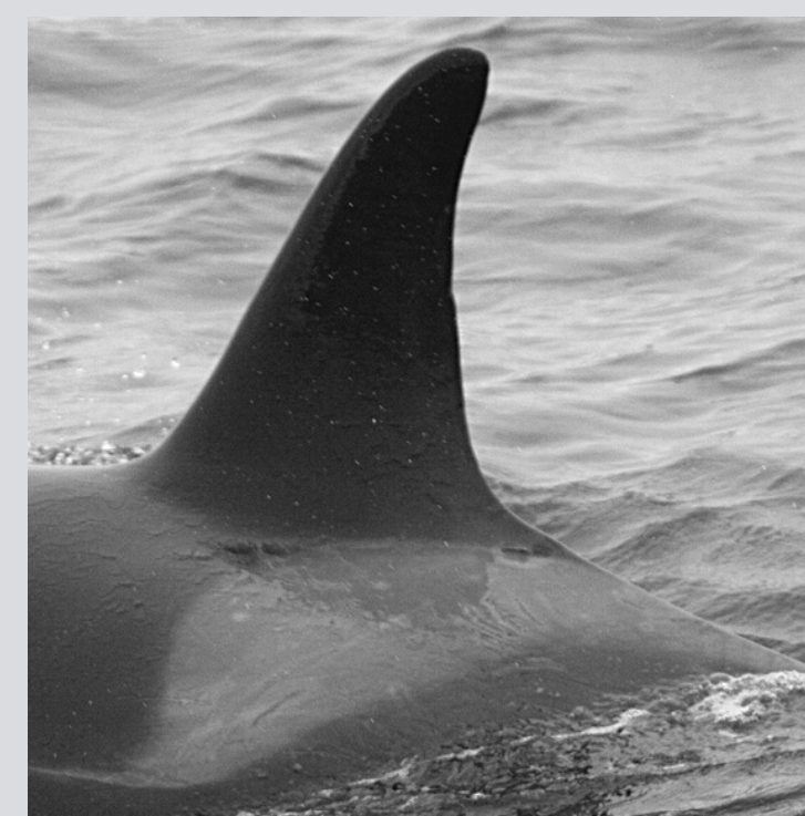
February 2012 Grundarfjörður, West Iceland