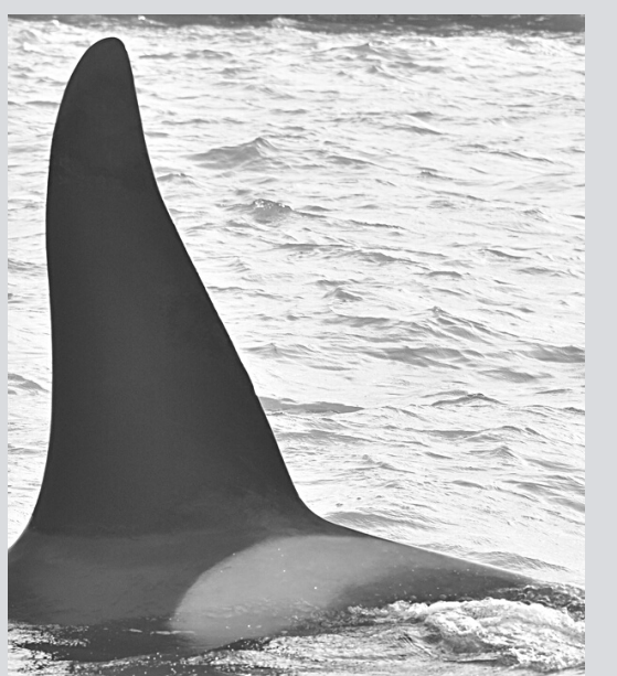
December 2019 Genoa, Italy