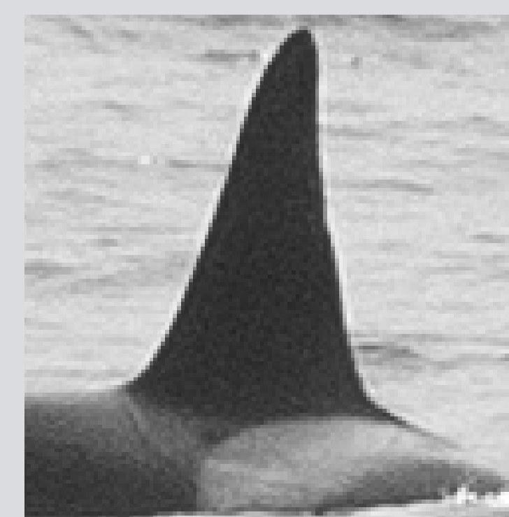
May 2021 Wick, Scotland

Images depict changes in appearance over time, such as fin growth and acquisition of new markings, of male individual "Gunnar" (Iceland ID: SN0068 – Scotland ID: 063). SN0068 is one of the individuals that have been spotted repeatedly both in Iceland and Scotland.