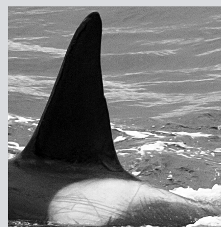
May 2019 Sarclet, Scotland