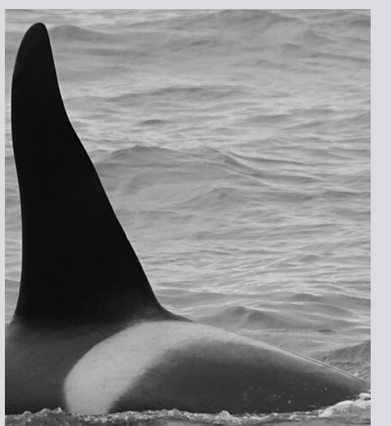
June 2018 Breiðafjörður, West Iceland

SN0113 "Riptide" was spotted in Breiðafjörður 2014–2018, 5 and was last identified near Haifa, Israel, in February 2020. Identification images of SN0113 on the right depict changes in appearance over time. When SN0113 was spotted near Haifa, the fin was leaning considerably towards the right.