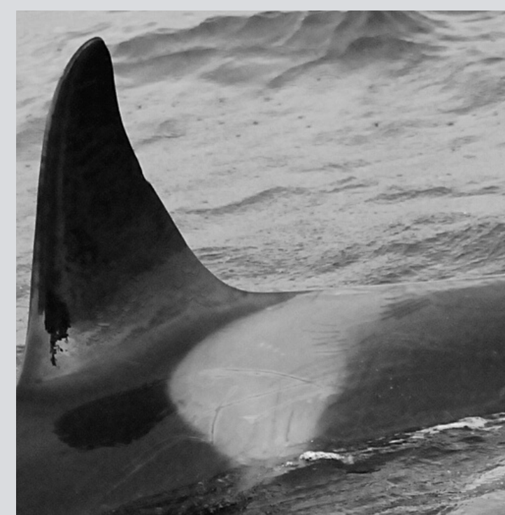
December 2015 Kolgrafafjörður, West Iceland