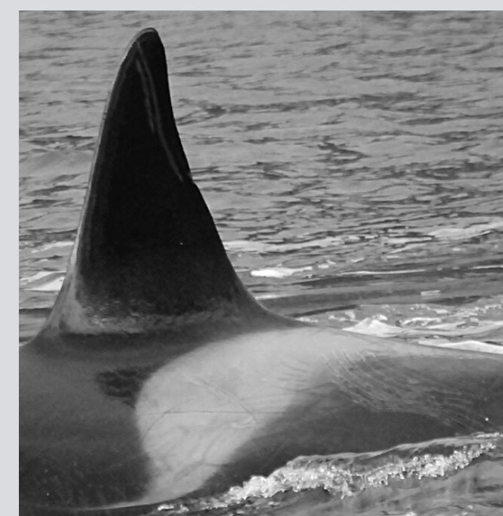
November 2016 Kolgrafafjörður, West Iceland