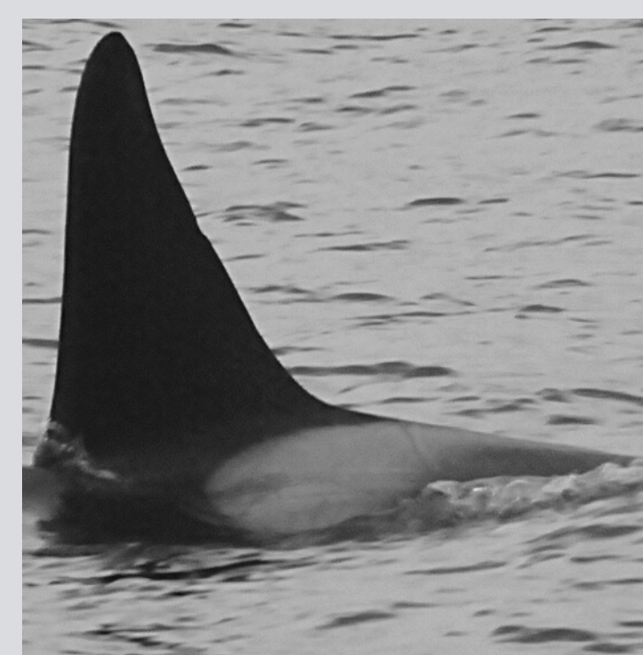
January 2018 Kolgrafafjörður, West Iceland