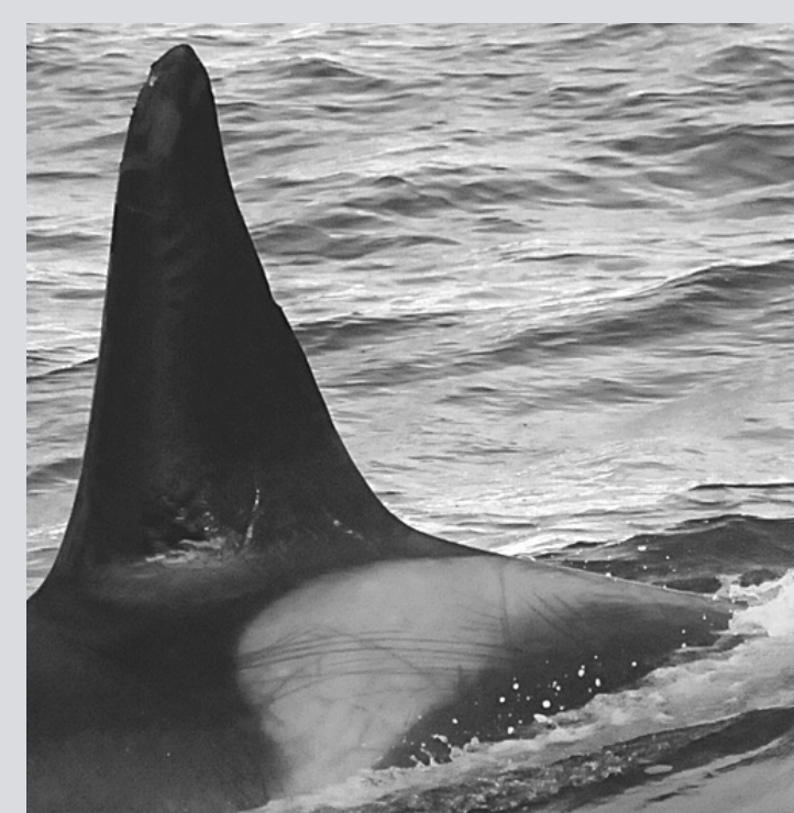
January 2019 Breiðafjörður, West Iceland