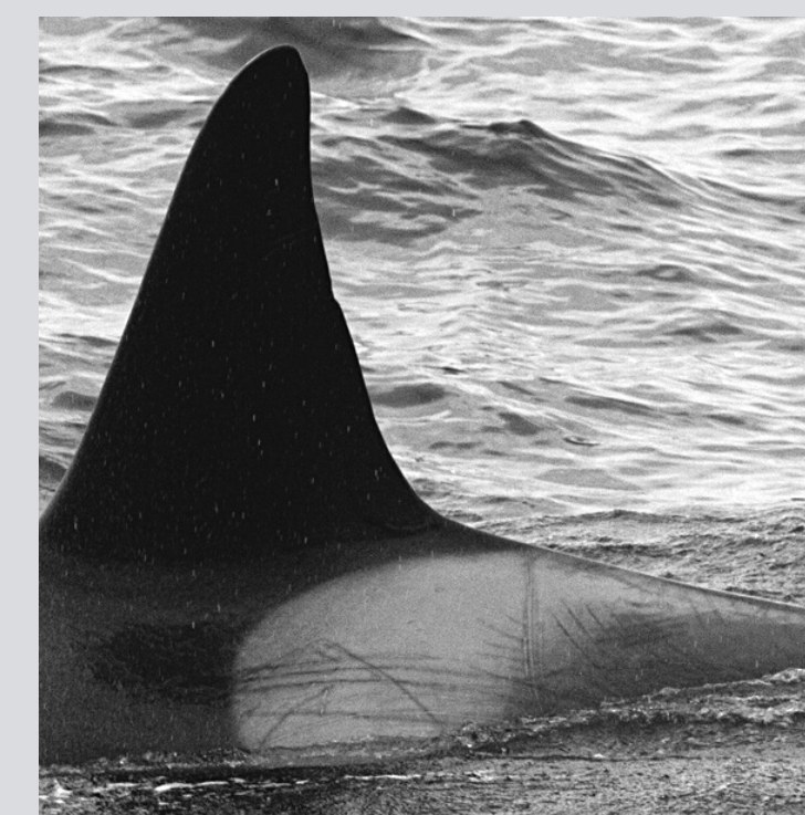
June 2017 Wick, Scotland