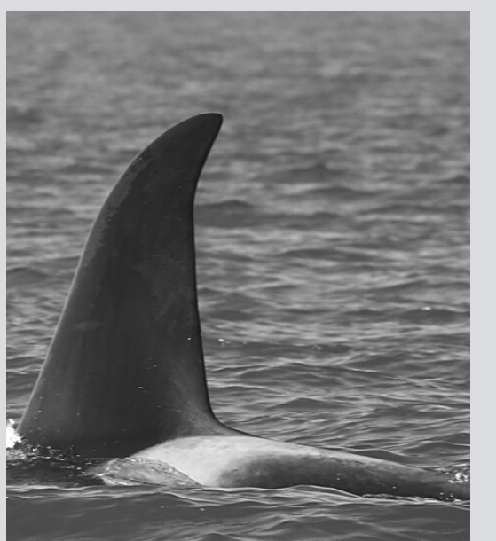
February 2020 Haifa, Israel