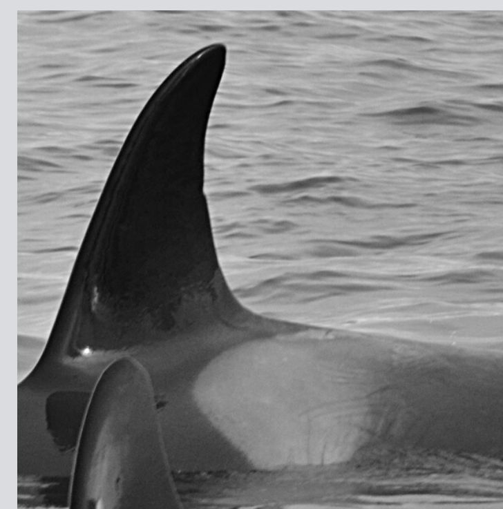
February 2014 Kolgrafafjörður, West Iceland