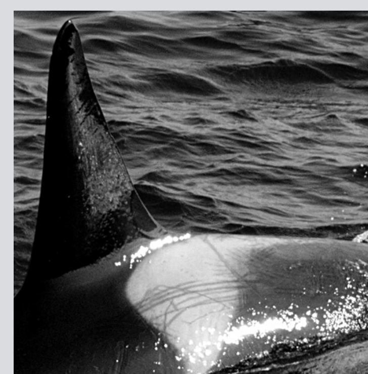
May 2018 Whaligoe, Scotland